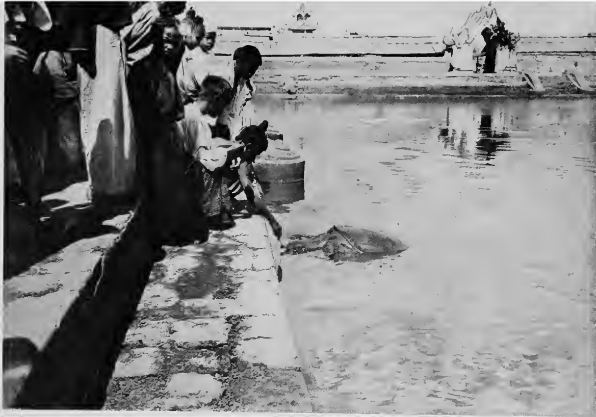
Sacred Turtle Tank, Arracan Pagoda, Mandalay